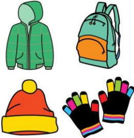
mindhaa faragashi iyo koofiyad